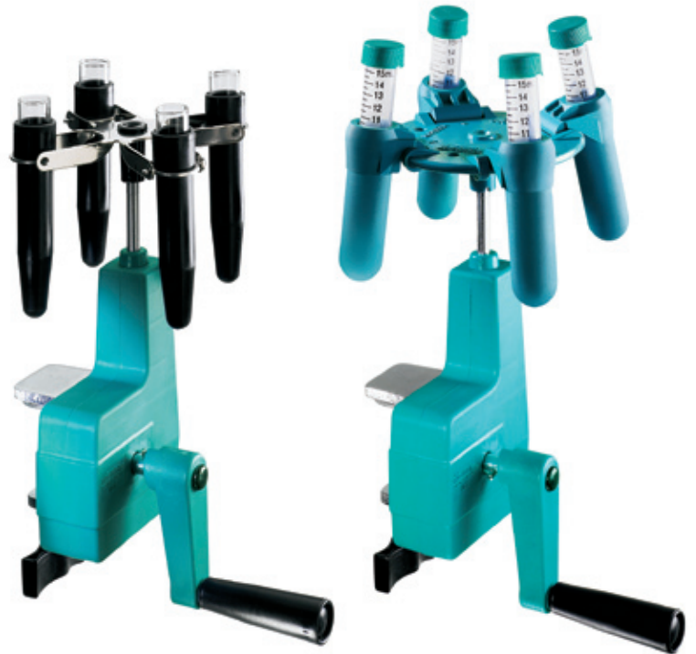
illustrated with rotor 1014 ↘ 90°

Rotor 1025 also accommodates a variety of other commercial tubes (also with round bottom) up to 15 ml. The tubes may have a max. length of 125 mm and a max. diameter of 17 mm.