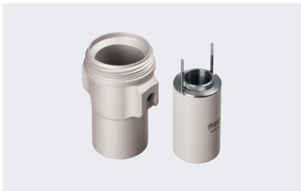
Carrier 1495 and insert SK 05.09