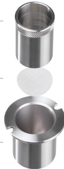
3-part stainless steel sample holder