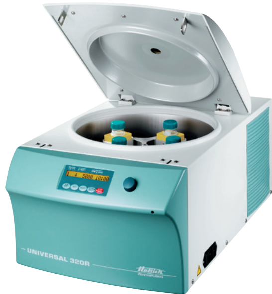
UNIVERSAL 320 R Benchtop centrifuge