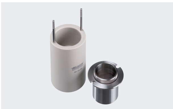
SK 05.09: plastic adapter and sample holder