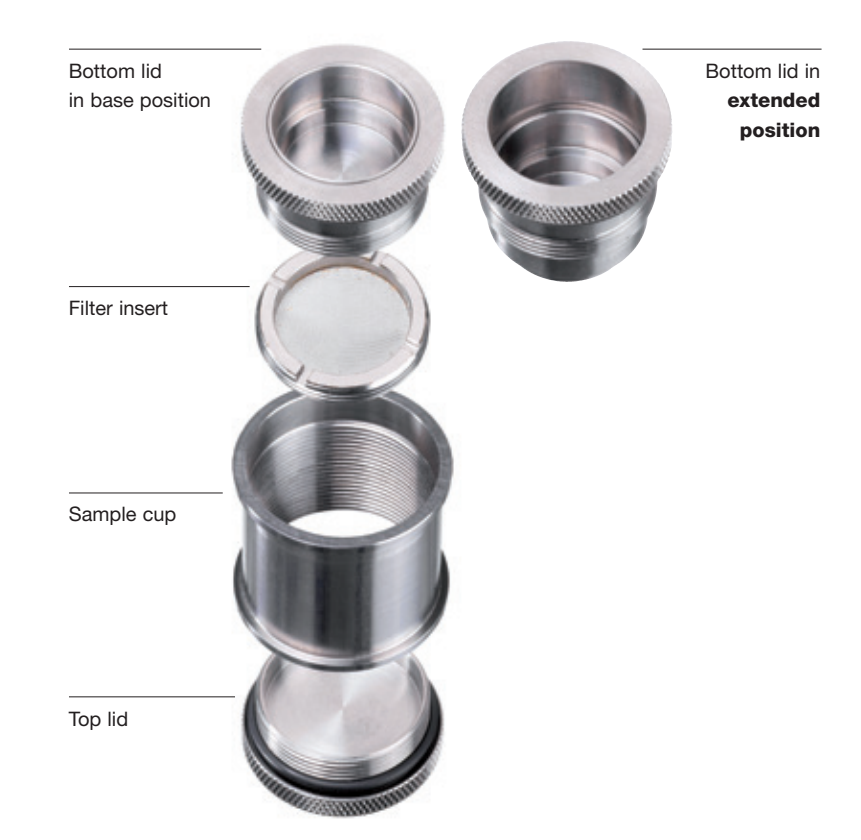
Fig. 1: Design of the sample cup