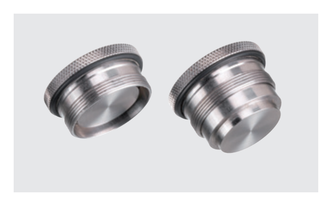
Fig. 2: Bottom lid in base position (left) and in extended position (right)

This flexible solution allows adaptation to different sample quantities and ensures an optimal heat transfer during the heating process.