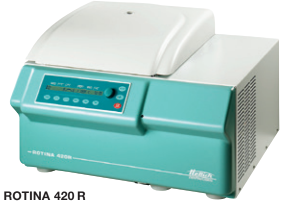
Benchtop centrifuge, cooled